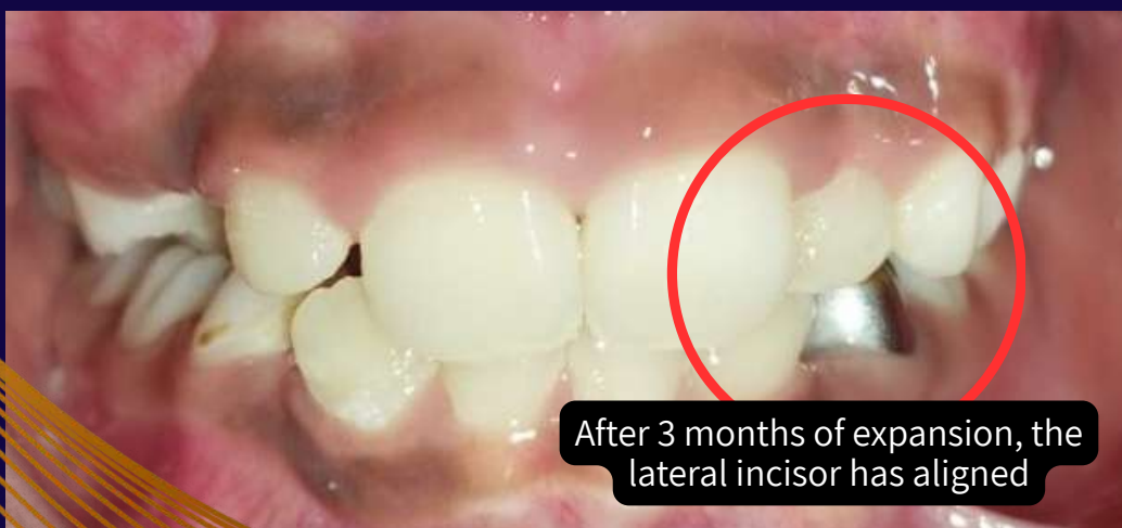
After 3 months of expansion, the lateral incisor has aligned