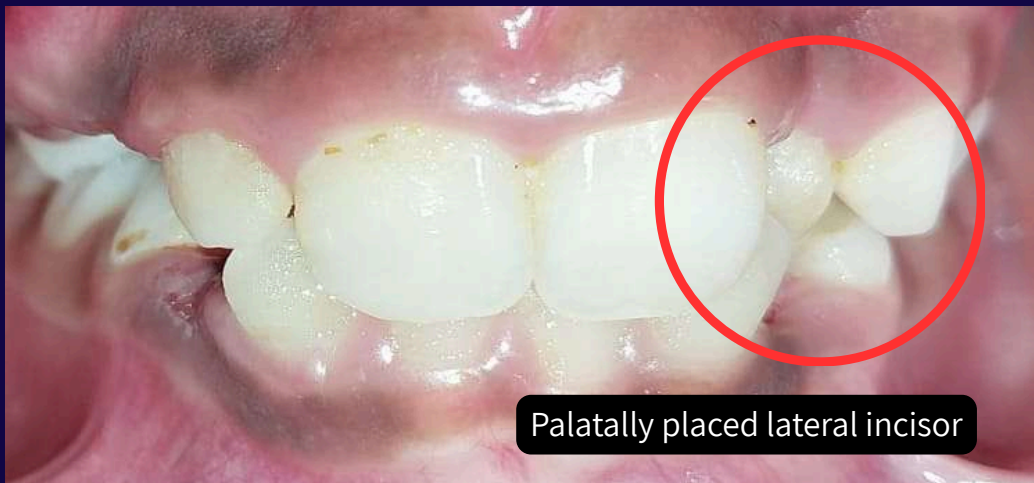
Palatally placed lateral incisor

A child visited us with multiple caries and alignment issues, after caries management and simple interceptive orthodontic treatment we could correct the alignment to a certain extent and decrease the severity, so the braces treatment when required can be simple and shorter in future..