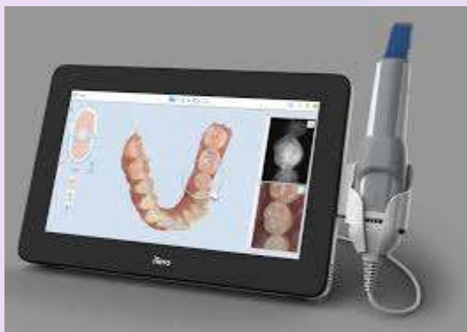
3D scans for 3D printed models

To help us plan your treatment, to prepare your temporary teeth, and make sure your implants are correctly placed, we will make a mold/impression of your teeth as they are right now, before treatment